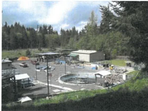
Granite Falls Wastewater Facility

Foreclosure .....$2,500.00 Fee (Attorney and Administrative Fees)